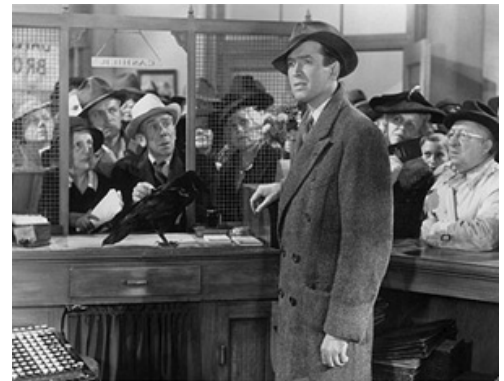
Bank run in the movie "It's a Wonderful Life" (1946)

The bailout of Freddie Mac and Fannie Mae will not be complete until Congress approves. Many analysts question whether the bailout is a good idea. What is certain is that more bank failures are likely in the coming months, as the crisis resulting from the bursting of the mortgage bubble works its way through billions of dollars in near worthless or deeply depreciated collateralized mortgage securities held by U.S. financial institutions in their asset portfolios. http://www.worldnetdaily.com/index.php?fa=PAGE.view&pageId=70120