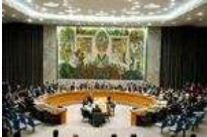
UN Security Council

DEBKAFfile Exclusive Report July 7, 2011,