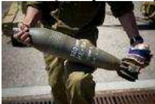
A 120mm mortar shell smuggled into Gaza

DEBKAFfile Special Report May 31, 2011 GazaEgyptIsraelHamasmissile attacks